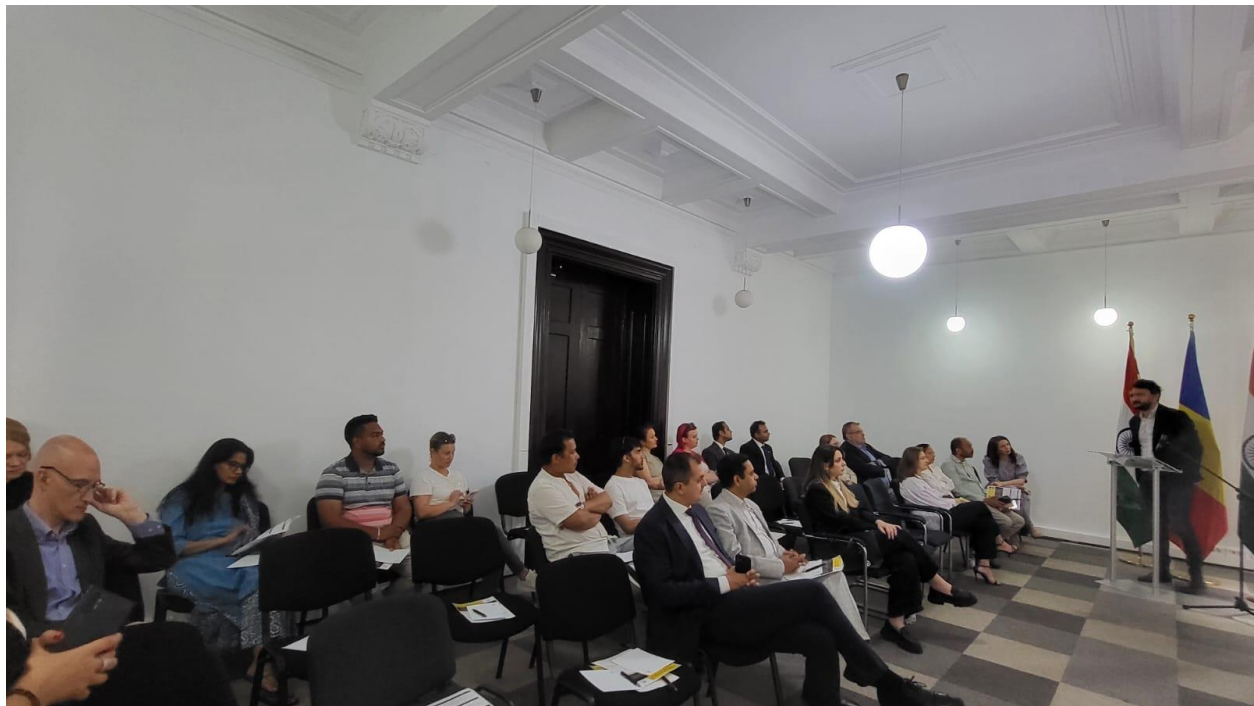
Romanian companies participated enthusiastically, engaging in interactive discussions