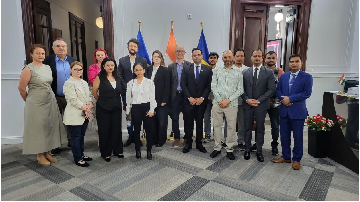
Group photo : Hybrid Seminar on Hiring of Manpower in Romania: Changes in 2026”